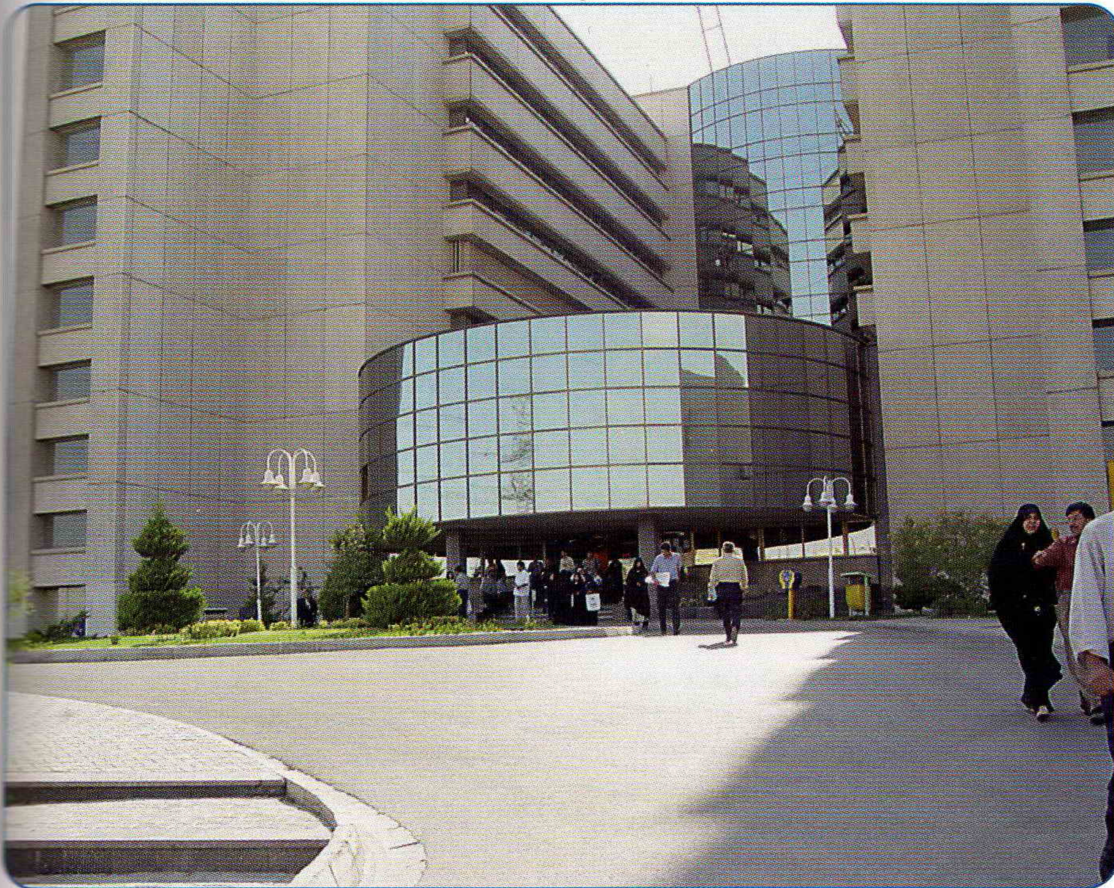
The Milad Hospital, Teheran